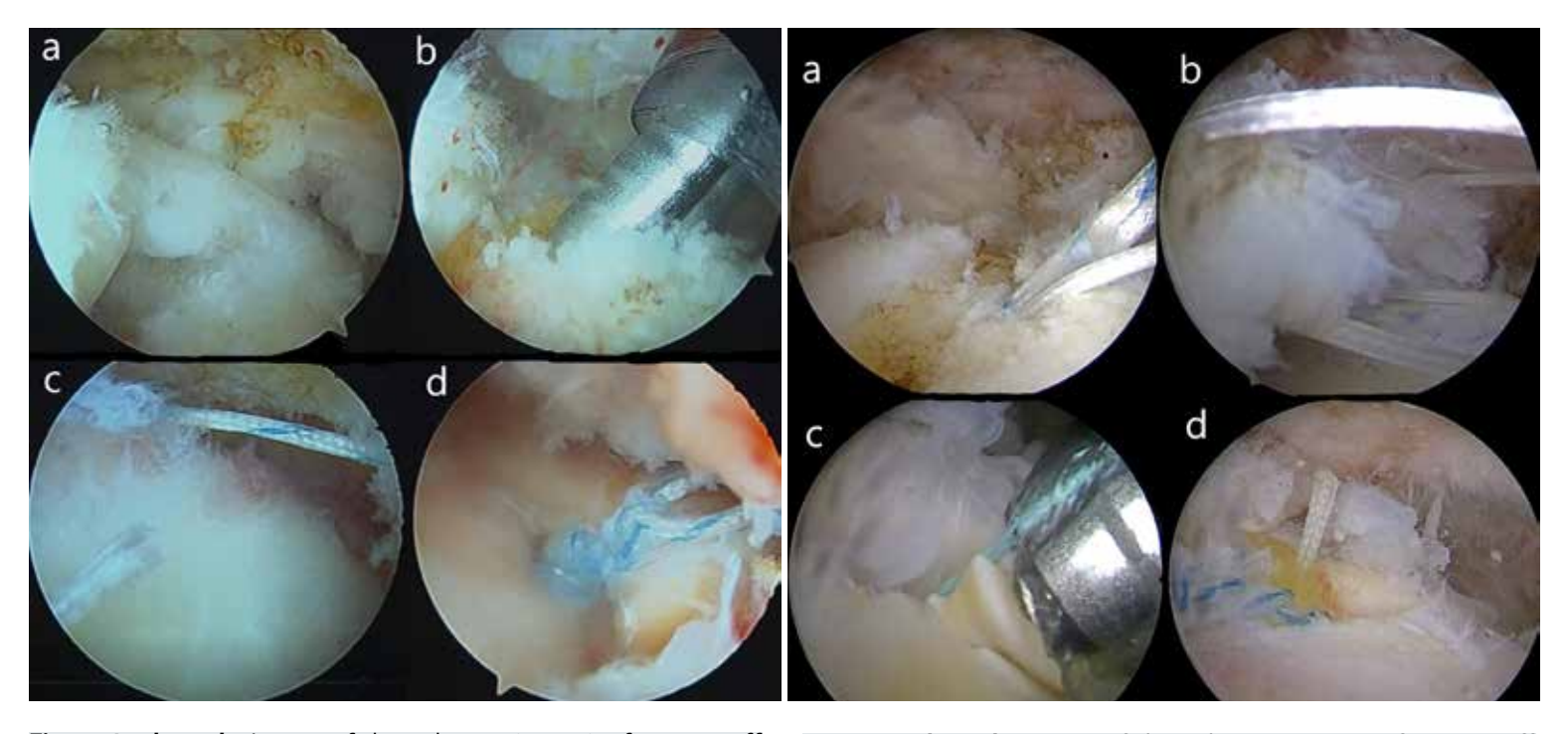
Figure 1a, b, c, d . Images of the arthroscopic repair of rotator cuff tears with single-row technique.

Abbreviations: VAS: Visual Analog Scale; ASES: American Shoulder and Elbow Surgeons Standardized Shoulder Assessment Form. Bold-italic values indicate statistical significance.